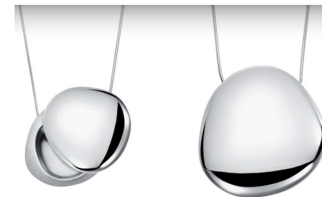
Small and large amulet

Whatever you decide to keep there, you can hide it from the world, look at it when you want to, or show it to someone else you want to share it with.