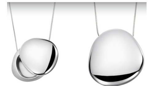
Small and large amulet

Whatever you decide to keep there, you can hide it from the world, look at it when you want to, or show it to someone else you want to share it with.